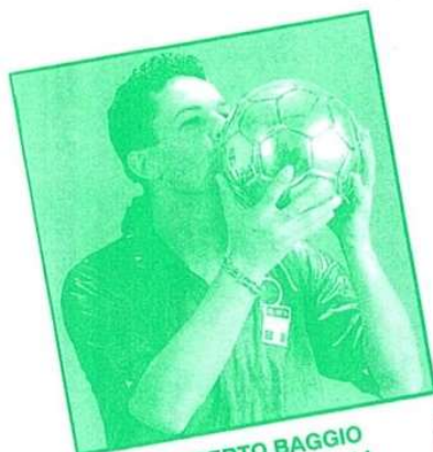
ROBERTO BAGGIO European and World Footballer of the Year