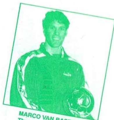
MARCO VAN BASTEN Three times European Footballer of the Year